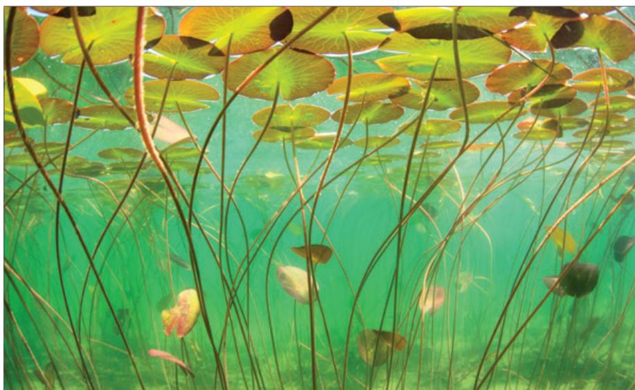
Figure 1. Water lilies form beautiful underwater landscapes with submerged root systems. The different parts of the plant produce unique sets of phytochemicals from which the root extract provides the most promising phytochemicals for hair care applications.

We argue that water lily flower extract is broadly used because of the flower's emotional, aesthetic appeal, whereas water lily root extract is deliberately used to achieve functional benefits.