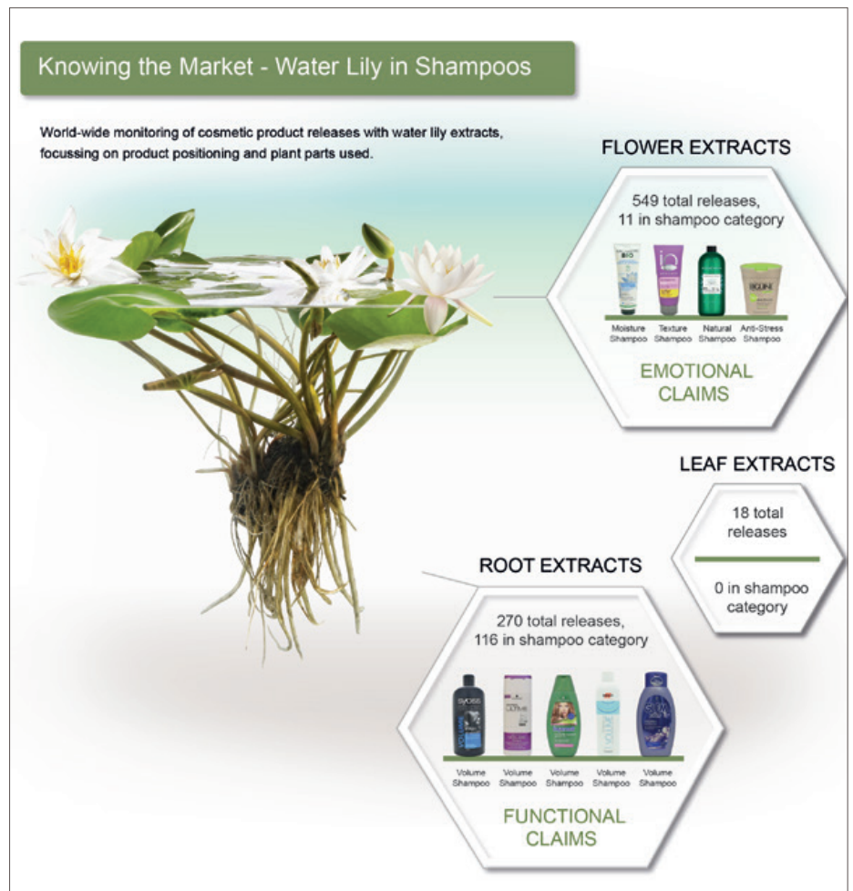
Figure 2. A market analysis reveals that water lily root extract is preferred in volume shampoos. Flower extracts serve divers marketing claims, building on the positive attributes associated with water lilies. Leaf extracts have only minor use.

test applying a shampoo with 0.5 % Water Lily Pro to one half of the head and a placebo shampoo to the other side of the head. Each side was washed, rinsed and dried according to a standard protocol. The study evaluated hair to hair orientation and alignment that often appears as frizzy, diffuse or flying hair.